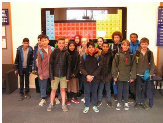
Photograph from Year 7 Visit

To stretch and enthuse some of our brightest students, we offer trips to The University of Sheffield's Schools laboratory. This year we took thirty Year 7 students to investigate chemical compounds. We also took twenty four Year 9 students to carry out a high level Chemistry extraction – producing aspirin from salicylic acid. The opportunity to experience the University, as well as to carry out a tricky chemical practical, will hopefully encourage these already excellent students to aim even higher.